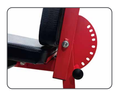
Backrest adjustment: 9 angles.