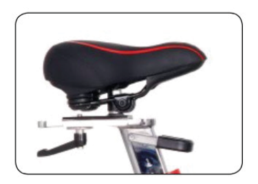
one simple touch for quick vertical setting

Loading QTY: 20'/40'/HQ: 118/246/270 pcs