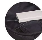
Connect Your Own Power Bank Inside