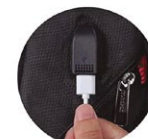
Connect with Your Own USB Cable