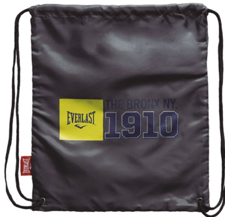
REF: EV2SKB32 COLOR:Gris