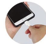
Connect Your Phone