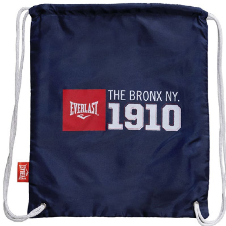
REF: EV2SKB33 COLOR:Blue